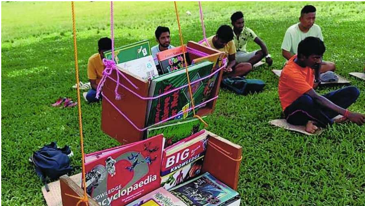
People gather on the European Club ground in Alipurduar to read books of the tree library on Sunday.

The books include works in Bengali, Hindi, Nepali and English language.